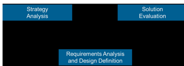
Fig. 2. Relationships between core knowledge areas derived from BABOK

Business analysis estimates total sales, costs, and profits after creation of marketing strategy for a new product. Thereby, a company determines if its objectives may be met 10,11 . Strategy analysis as part of business analysis provides context to requirements analysis and design definition for a given change 12 . The role of a business analyst and his or her deliverables explains the benefits of this management discipline. She or he takes information from strategic plans and goals to conduct a feasibility study and to develop a business case that includes cost estimates and business benefits. Based on that, a decision can be made by the sponsor. That means, a proposal for a new project is being selected or rejected 13 . If a project proposal is approved, a project manager will initiate the project. Due to PMBOK 14 , projects are initiated because of internal business needs or external influences which trigger needs analysis, business cases, and feasibility studies. Hence, deliverables of business analysis are linking strategy with projects. BABOK 15 illustrates the relationships between its knowledge areas. In the core, the link between strategy and requirements is presented (Figure 2). Requirements analysis is an essential part of scope management following project initiation. Again, links between company strategy, projects, and product requirements become apparent.